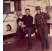
3 rd , 4 th and 5 th generation Loos'