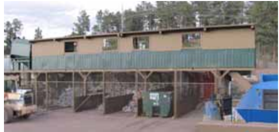
Here we are now