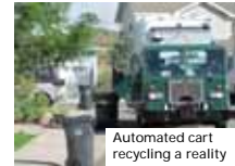
Automated cart recycling a reality