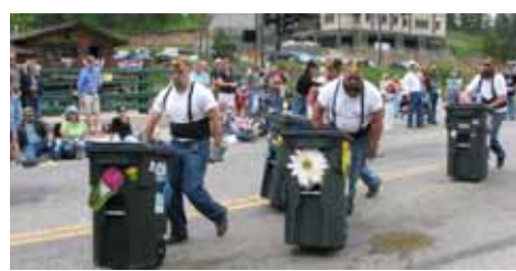
2009 Evergreen Rodeo Parade Mining for Gold in our Recycle Bins