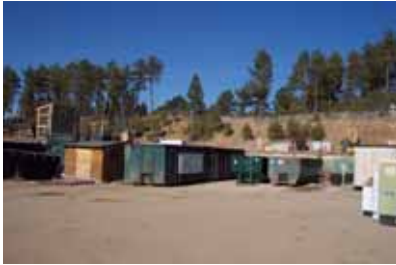
This was then