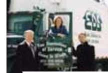
Continuing to be innovative