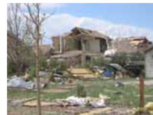
Tornados in Weld County in 2008